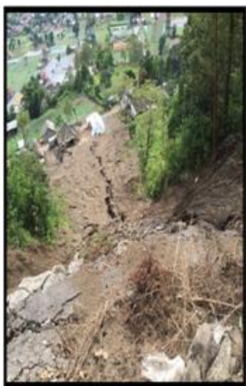
FIGURE 1A. LANDSLIDE LOCATION IN SONGAN VILLAGE, SUB DISTRICT OF KINTAMANI

The analytical method used is descriptive qualitative, ie giving meaning to result of field observation and result of interview with community around research location, so that able to describe phenomenon that happened at research location that is sub district of Kintamani, Bangli Regency, Bali Province, Indonesia.