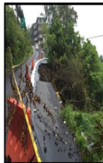
FIGURE 1C. LANDSLIDE LOCATION IN YEH MAMPAH VILLAGE SUB DISTRICT OF KINTAMANI