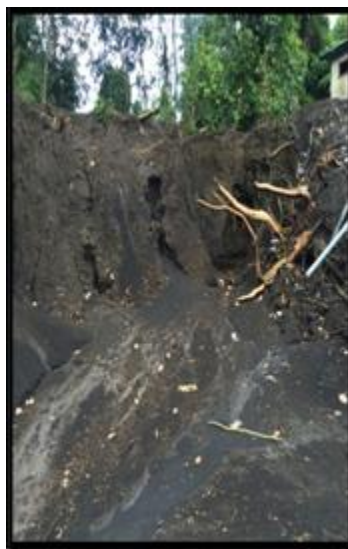
FIGURE 1B. LANDSLIDE LOCATIONS IN PENELOKAN VILLAGE, SUB DISTRICT OF KINTAMANI