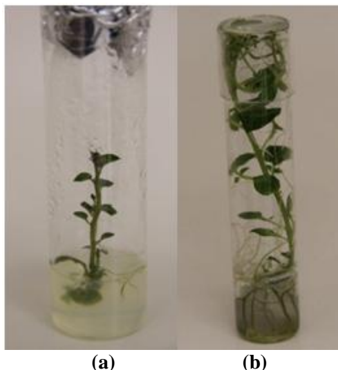
FIGURE 2. PLANTS OBTAINED FROM SHOOT TIP CULTURES a) 3-4 WEEKS AFTER b) 6 WEEKS AFTER

To determine the effects of the medium solution, the planting position (either horizontally or vertically), and type of medium (whether in a solid or two-phase medium), during microtuberization on the development of microtubers, single node explants obtained from plants that were grown in vitro were planted either horizontally or vertically into glass jars of dimensions 6.5x7.5 that had 50 mL each of either the solid phasic or two-phase MMS medium (Figure 3). The MMS medium used was made up of JA (0, 10 ng/L, 1 µg/L and 0.2 mg/L), GA 3 (0 and 0.2 mg/L), and the combination of these in addition to 80 g/L sucrose and 7 g/L agar. The MMS medium was also adjusted to have a 5.7 pH [9, 26, 34]. Ten explants were planted into each of the 5 jars used and each experiment was repeated 5 times. The cultures were then incubated in a climate chamber for 4-6 weeks at a temperature of 22-25°C and a light intensity of 145 µmol m -2 s -1 during an 8 hours light and 16 hours dark photoperiod (short day) [36]. At the end of the incubation period, the number of single nodes obtained from explants, the number of explants from which microtubers were obtained, explant yield (number of explants from which microtubers were obtained/total number of explants), and the microtuber yield (number of microtubers/total number of explants) were determined for each group. The data was shown as percentages (%) in a chart.