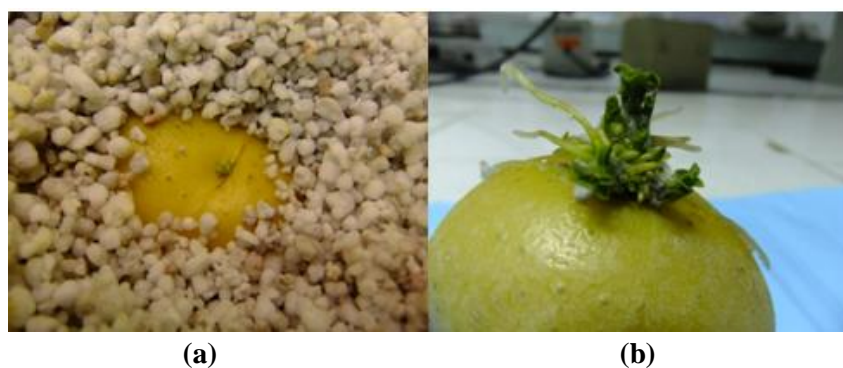
FIGURE 1. SHOOT DEVELOPMENT ON TUBERS a) AFTER 1-2 WEEKS, b) AFTER 3-4 WEEKS

The study was conducted in four stages: The S. tuberosum tuber shoots in vivo , in vitro shoot tip cultures, micropropagation, and microtuberization. For the purpose of shoot development, the potato tubers belonging to the Marfona variety are first washed under tap water, then they are placed in a 15% commercial sodium hypochlorite (NaOCl) solution and left there for 20 minutes. They are then washed with distilled water 3 times [28] so that surface sterilization can occur. The tubers that had their surfaces disinfected are then planted into a pot filled with perlite and left to grow in a climate chamber that has a temperature of 30-35 °C, 60-65% humidity, a light intensity of 145 µmol m -2 s -1 , and left for photoperiods of 16 hours in light and 8 hours in dark [29]. After 4 weeks, successfully grown shoots were obtained (Figure 1).