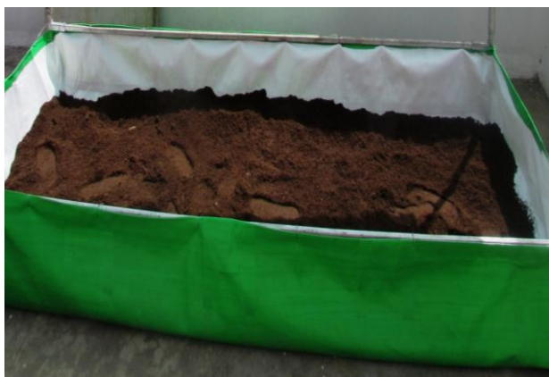
FIG-2: PORTABLE HDPE VERMI BED