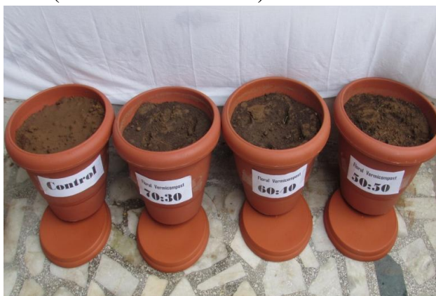
FIG-3 POT CULTURE OF FLORAL WASTE VERMICOMPOST