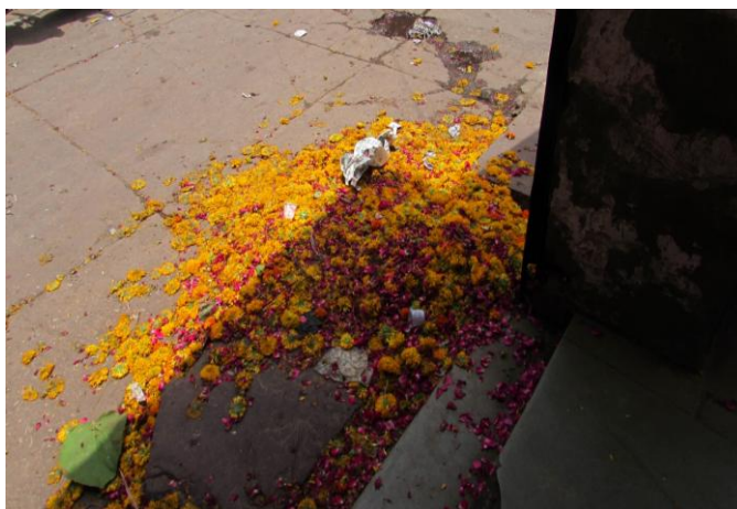
FIGURE 1: WASTE OUTSIDE TEMPLE (BEFORE SEGREGATION)