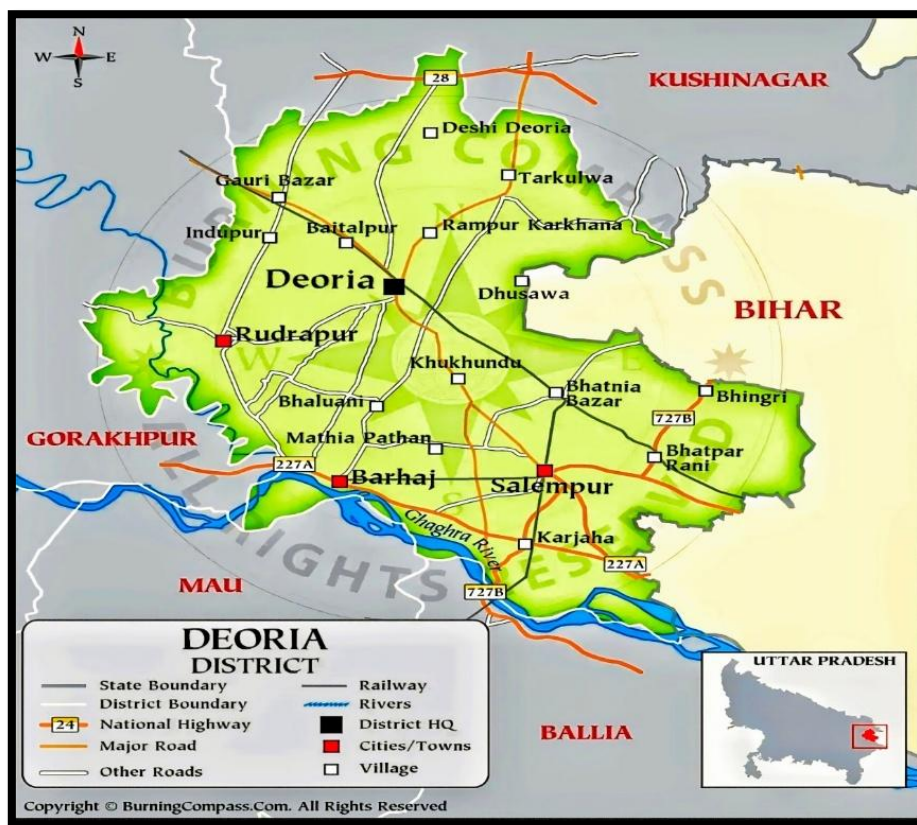
FIGURE 1: Map of research area showing Deoria district in Uttar Pradesh

A total of 100 beneficiary farmers were randomly selected as respondents for the study. Data were collected using a structured interview schedule. Statistical tools such as Mean Percent Score (MPS), ranking method, frequency, and percentage were employed for data analysis.